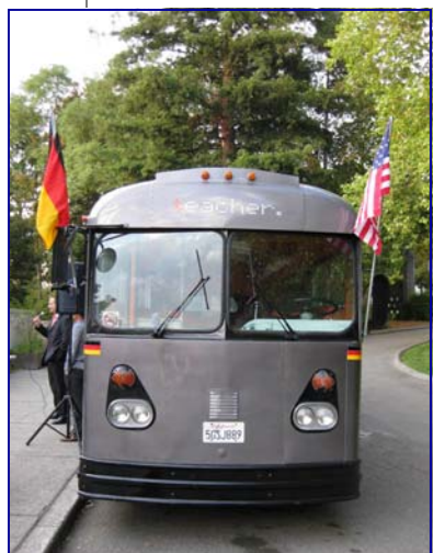
The German Bus, a traveling language program sponsored by the Goethe Institute, visited UW on October 7, 2008 as part of an event sponsored by Germanics and the German Consulate in San Francisco.

ministrative offices on three levels, including the new mezzanine. While it will maintain the mezzanine level, other aspects of the original building will be resurrected in the 2009-11 reconstruction. The building will once again host skylights and an open central stair; the building will also be brought up to current code and accessibility will be vastly improved.