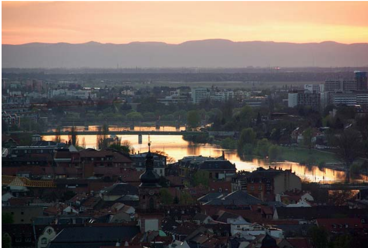
Historic Old City and 'Neuenheimer Feld'