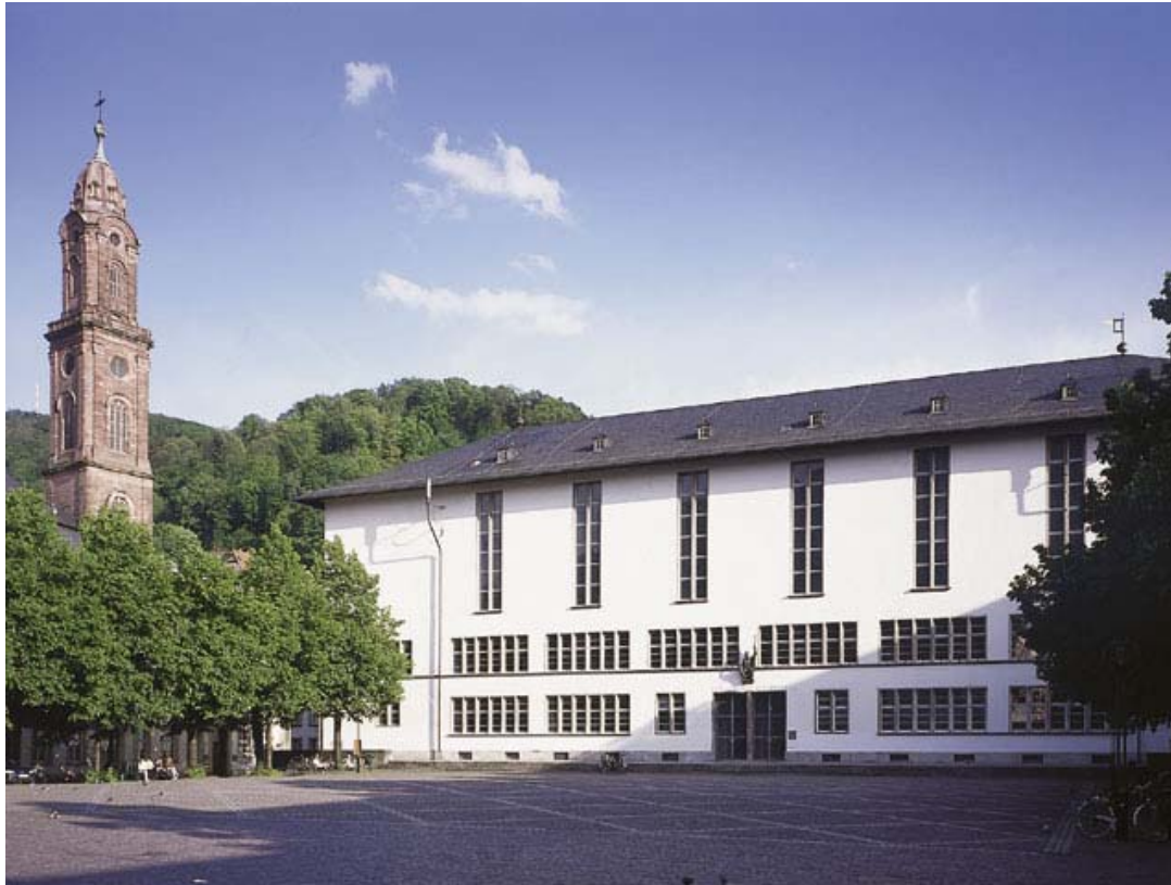
Uniplatz and 'Neue Aula' (Main Lecture Hall Building for the Humanities)