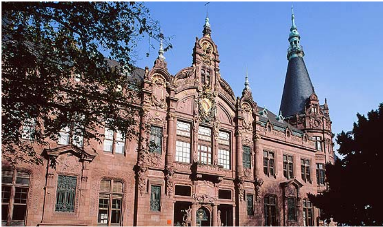
University Main Library