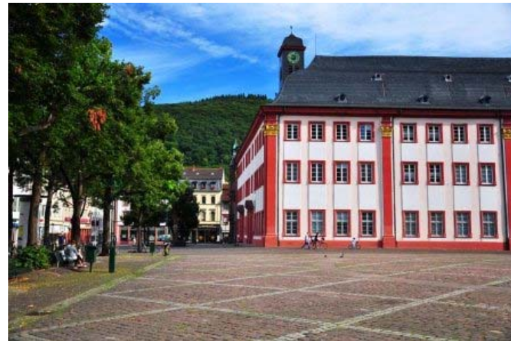
Uniplatz and 'Alte Aula'