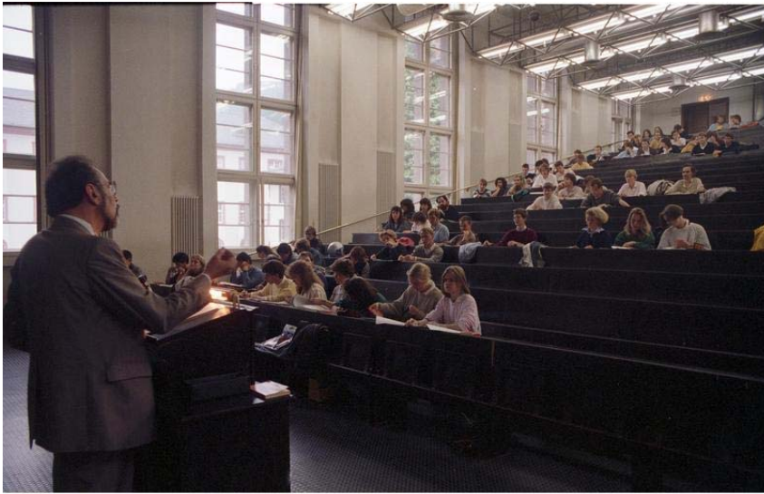
Juni 1955