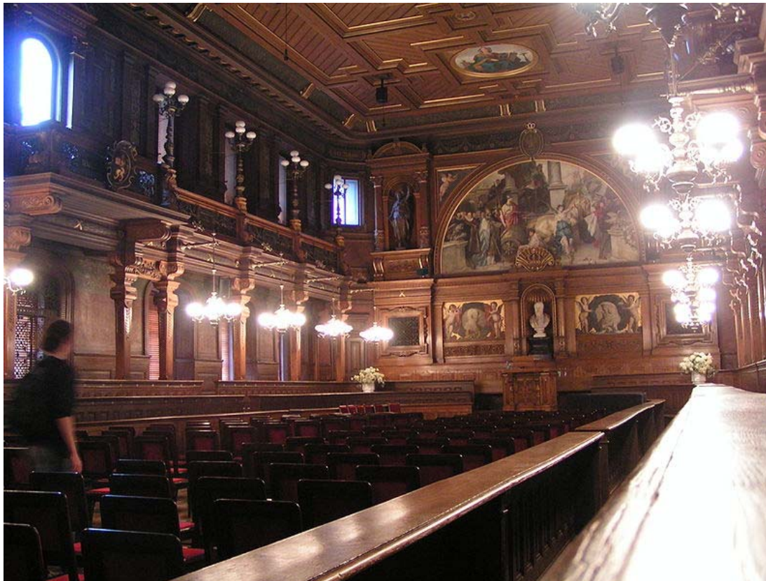
Alte Aula (Old University Hall)